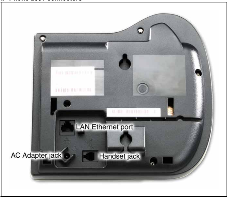
Figure 4 IP Phone 2001 connectors

This figure shows the location of the connectors on the back of the IP Phone 2001 terminal.